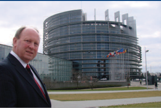
Outside Strasbourg Parliament