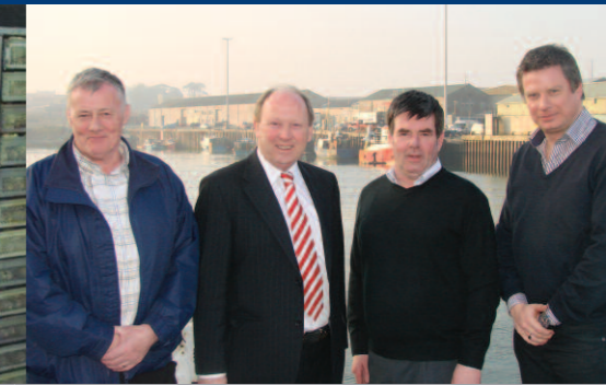
Meeting fishermen's representatives in Kilkeel