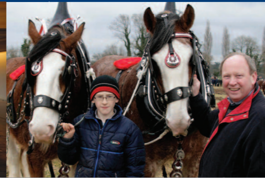
At Mullahead Ploughing Match