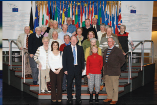
Welcoming visitors to Strasbourg