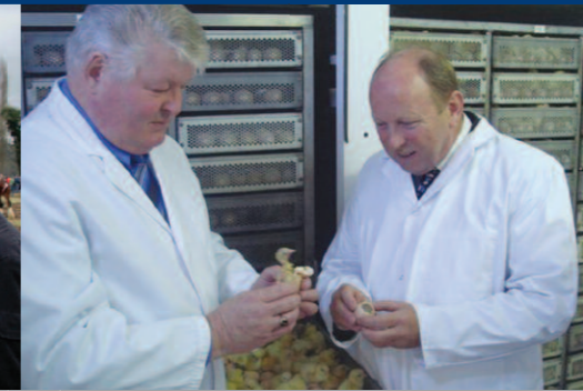
Visiting O'Kane's Hatchery