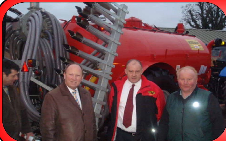
Jim Allister visiting the recent agricultural machinery show in Fintona

Only by voting for the Traditional Unionist in June's poll can the people of Ulster hope to thwart the advance of Sinn Fein/IRA.