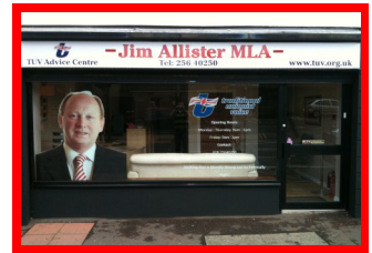
July 2011: Jim Allister MLA opens his constituency office in Ballymena

Additionally, I pressed her on what plans she had to oversee a reduction in the cost of electricity.