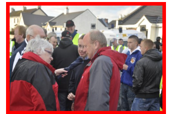
August 2011: Yet again the minority Protestant community face discrimination in Rasharkin

“The TUV welcomes the public meeting as it affords members of the public the opportunity to demand answers from their local representatives. The devolved administration in Northern Ireland was hailed as a great achievement by the architects of the Belfast Agreement because it was said to provide caring, responsive government and an opportunity for the people to hold their politician's to account. The response to public opposition to closure of the City's A & E will test that pledge.