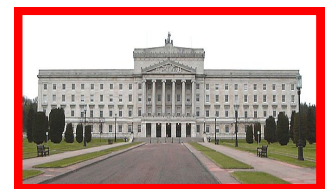
August 2011: Jim Allister MLA submits a complaint to Assembly Ombudsman over David Ford's handling of the Gratuity Payment

“In addition to continuing to lobby for those ex Reservists who have approached me I will be urging them to refer the matter to the Ombudsman as maladministration because of the inadequacy of the publication process, the lack of serious effort to contact those who had served - though their contact details were obtainable - and the absence of an accessible and serious appeal process.”