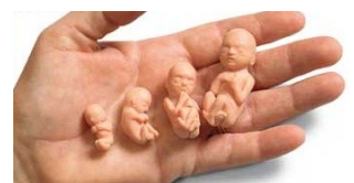
Jim Allister MLA has questioned if embryos are safe in the hands of the Executive

troubling ethical issues flowing from IVF. Of most significance is the destruction of unused embryo's. A human embryo is, biologically, a living human being at the earliest stage of its development. Of course, it is dependent on the mother to nurture it and give it life, but, genetically, it is a distinct organism, different from both the egg and the sperm from which it grew. It does, in effect, need nothing more than the nourishment of the mother to grow into a recognizable human being. Thus, the destruction of a thousand embryos a year in Northern Ireland is a troubling issue."