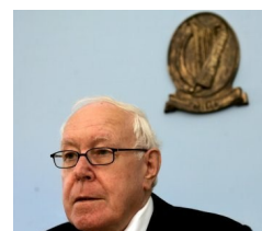
Joint FM McGuinness is named at Smithwick Tribunal

Maze Project as part of their re-write of history and that it will indeed become a place for the glorification of their wicked terrorists. Hence, the abject folly of this project and the blight which it will bring to the worthwhile elements of the Maze regeneration."