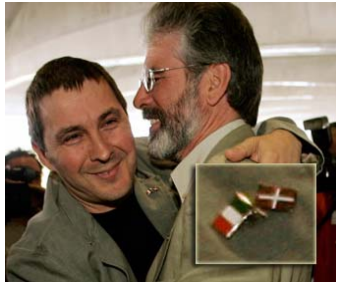
Sinn Fein leader with his counterpart, Arnaldo Otegi, the leader of ETA's Batasuna Party

Learn from our mistakes. In 1994 the IRA announced a ceasefire, which proved merely tactical as 18 months later they launched the infamous Canary Wharf bombing attack and dipped in and out of terror as it suited. In 1998 they promised to decommission within 2 years, yet it was not till 2005 that they made any notable delivery. They were foolishly and prematurely admitted to Government in Northern Ireland, only to launch their "Stormontgate Spy-ring". In late 2004 they purported to engage in genuine political negotiations, while all the time they were planning the biggest heist in UK history, the "Northern Bank Robbery" and weeks later IRA men murdered Robert McCartney. Now they want back into government, but think they should keep their "Army Council"!