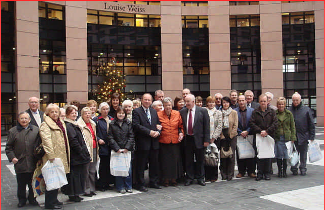
Jim Allister welcoming a large group of Ulster visitors to the European Parliament in Strasbourg.